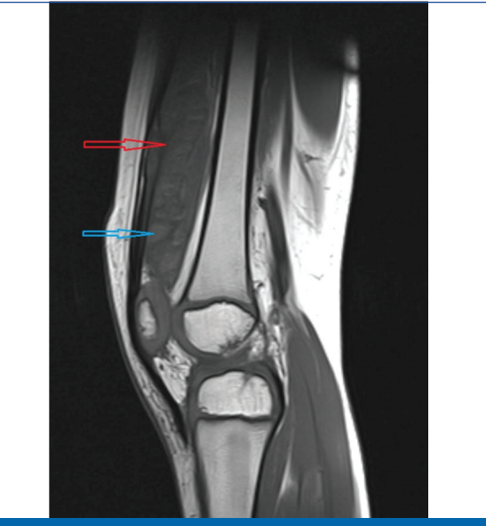
[Table/Fig-3]: Sagittal T1 weighted image showing T1 isointense (red arrow) lesion with internal areas of hyperintensity (blue arrow) suggestive of haemorrhage within it.

Lesion was surgically excised and histopathological evaluation revealed thin walled erythrocyte filled vascular spaces lined by endothelial cells within a dense connective tissue matrix, indicative of a haemangioma. No evidence of any swelling, pain or restricted joint motion was found at follow-up examination done three months later.