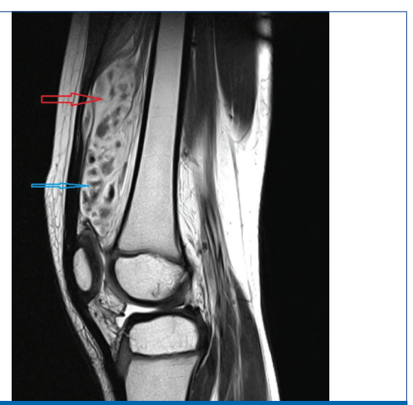
[Table/Fig-1]: Sagittal T2 weighted image showinglobulated T2 hyperintense (red arrow) lesion in the suprapatellar recess of knee with multiple small T2 hypointense (fully arrow) regions within it

A well defined lobulated lesion measuring ~6.8×2.1×5 cm (Cranioc audal×Anteroposterior×Mediolateral) was seen in the suprapatellar recess of knee anterior to the lower third of femur extending into synovial cavity of patellofemoral joint compartment. It appeared heterogeneously hyperintense on PDFS/T2 weighted images and isointense on T1 weighted images with multiple small PDFS/T2 hypointense regions within it [Table/Fig-1-3]. Multiple small T1 hyperintense foci, suggestive of haemorrhage were also noted within it [Table/Fig-3]. The lesion showed intense heterogeneous post contrast enhancement [Table/Fig-4a,b]. Adjacent bones and muscles appeared normal. Minimal fluid was seen in the lateral patellofemoral compartment.